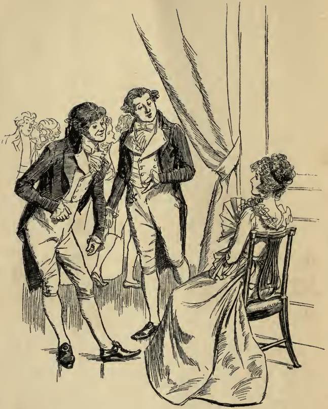
Mr. Dashwood introduced him.—P. 219.